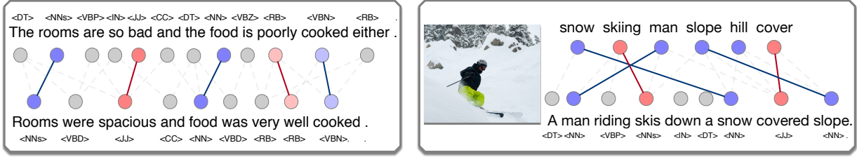
Figure 1: Semantic Matching between the potential target (top) and the generated texts (bottom). The left shows how to partially match two texts with different styles. The right shows how to partially match texts with concepts detected from the images.

Text-to-Text Matching We consider semantic matching between two sequences in Seq2Seq models, where partial matching is important: i ) in the unsupervised setting, such as non-parallel style transfer, partially matching between the source and target texts is helpful for content preservation. ii ) in the supervised setting, such as table-to-text generation, partially matching the input and target sequences can effectively avoid hallucination generation, i.e. text mentions extra information than what is present in the source. Figure 1 shows an example of partial matching, where part-of-speech (POS) tags for each word are exploited to provide prior knowledge. In these cases, directly applying OT will cause imbalanced transportation issue or poor performance.